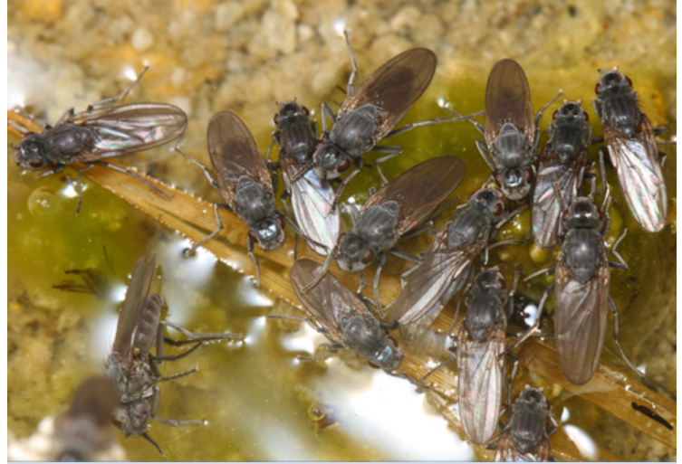
Swarms of alkali flies line the shores of Mono Lake, transforming algae into a rich food source for the migratory birds that stop here by the thousands