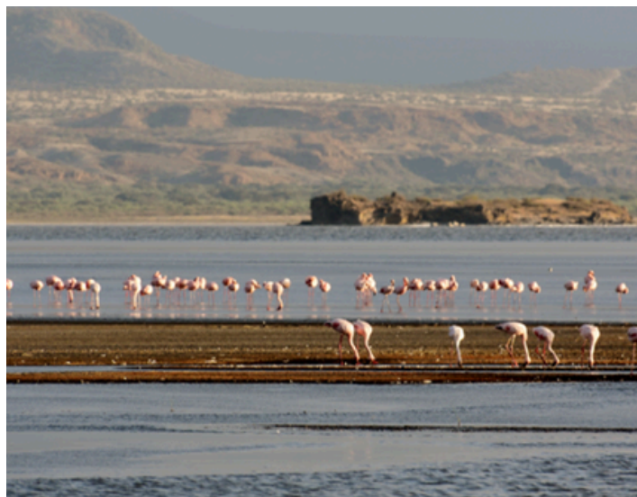
Flamingos wade in Lake Natron, a soda lake in northern Tanzania. Soda lakes like this one are found around the world today, and on early Earth there were likely many more, offering rich chemical settings where life could have begun.