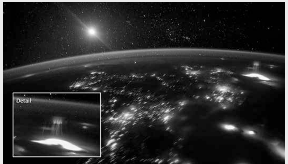
Sprites and other TLEs are visible from the International Space Station (ISS). Crew members capture these events using wide focal lengths and time-lapse photography.