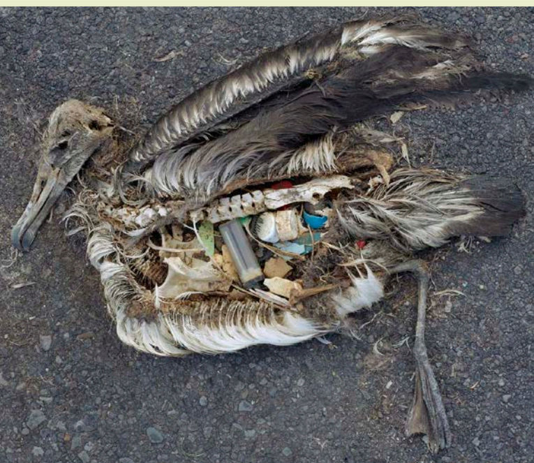
The unaltered stomach contents of a dead albatross chick photographed on Midway Atoll National Wildlife Refuge in the Pacific in September 2009 include plastic marine debris fed the chick by its parents.