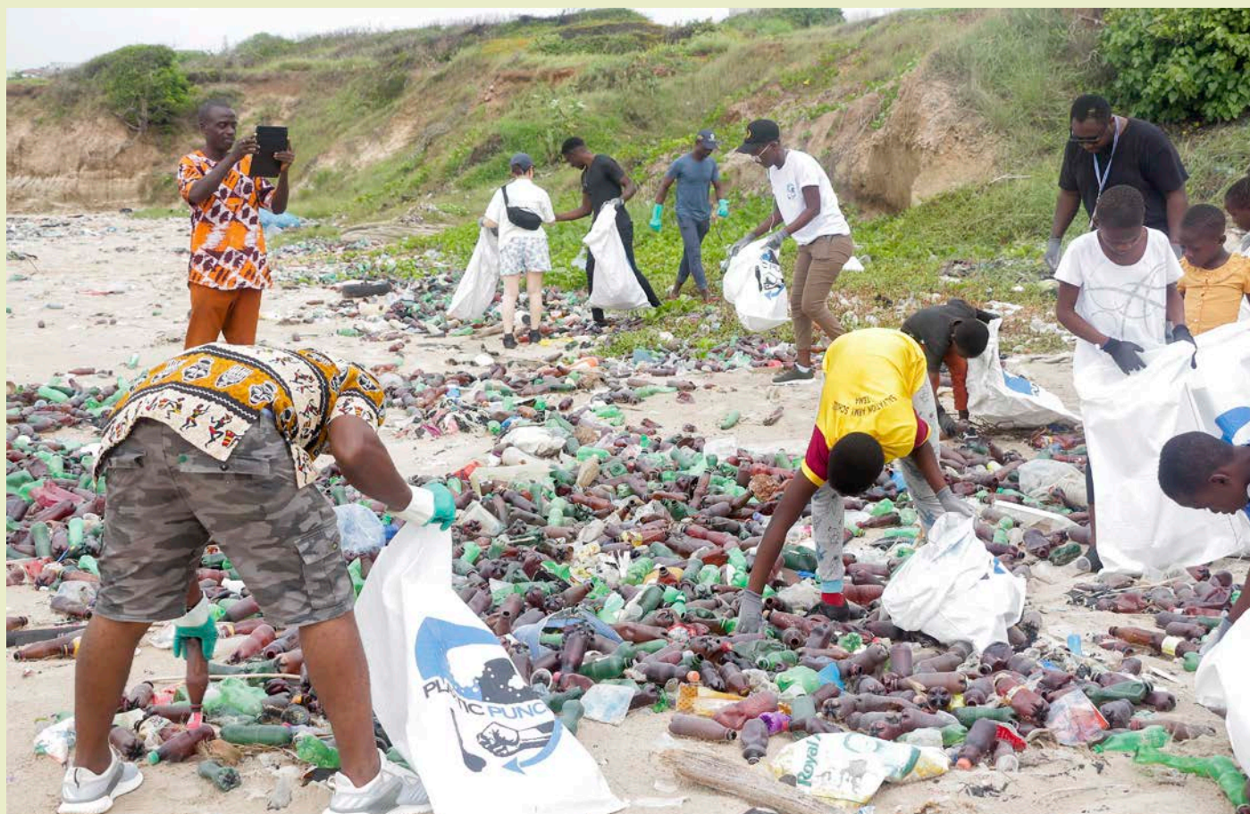
Volunteers in Ghana cleaning a beach.