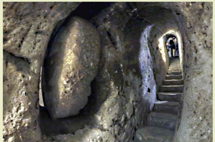
A stairway and one of the large stone doors that could be rolled into place to block intruders into the underground city of Derinkuyu.