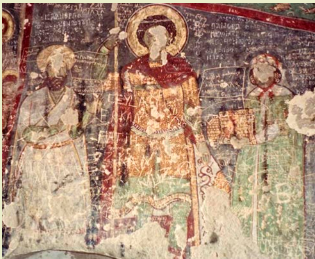
This painting inside one of the churches depicts Saint Basil the Great, who served as a bishop of the early church in Cappadocia from 370 until his death in 379.