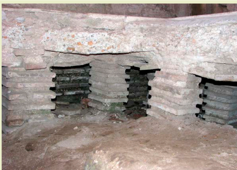
Ancient Roman floor heating (hypocaust) in Ostia Antica, southwest of Rome.