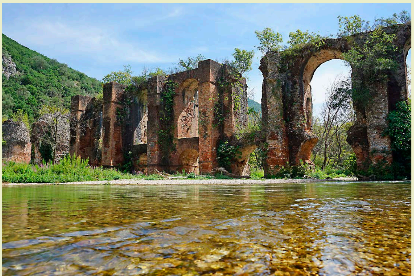
Ruins of ancient Roman Aqueduct of Nicopolis at Agios Georgios, Greece: the southern arcade.