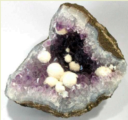
A geode containing balls of mordenite with very delicate needles that grew and were preserved in the void.