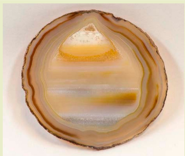
Agate forms from silica-rich fluids within a void. Deposition was concentric followed by a bottom-up sequence, with crystals forming in a tiny void at the top of the geode.