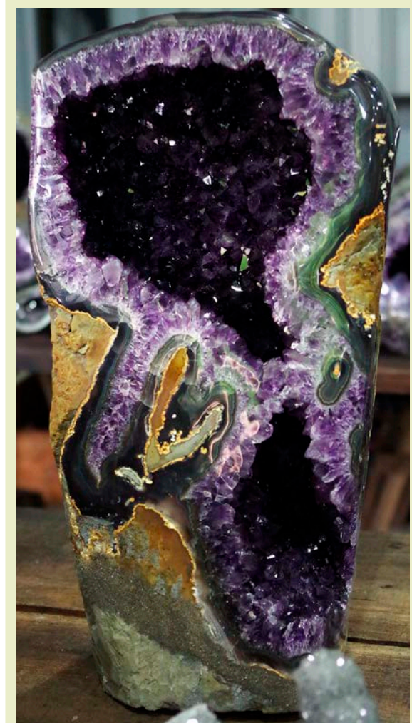
This large geode filled with deep purple amethyst was found within volcanic bedrock near the city of Artigas in Uruguay.