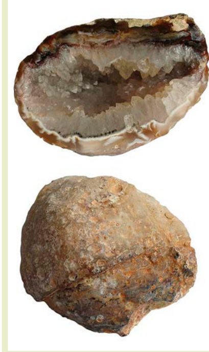
A quartz-filled geode, shown from inside (top) and outside (bottom).