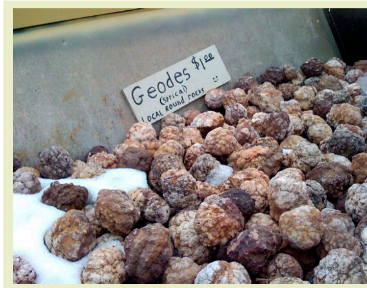
A pile of unopened geodes for sale in central Arizona.