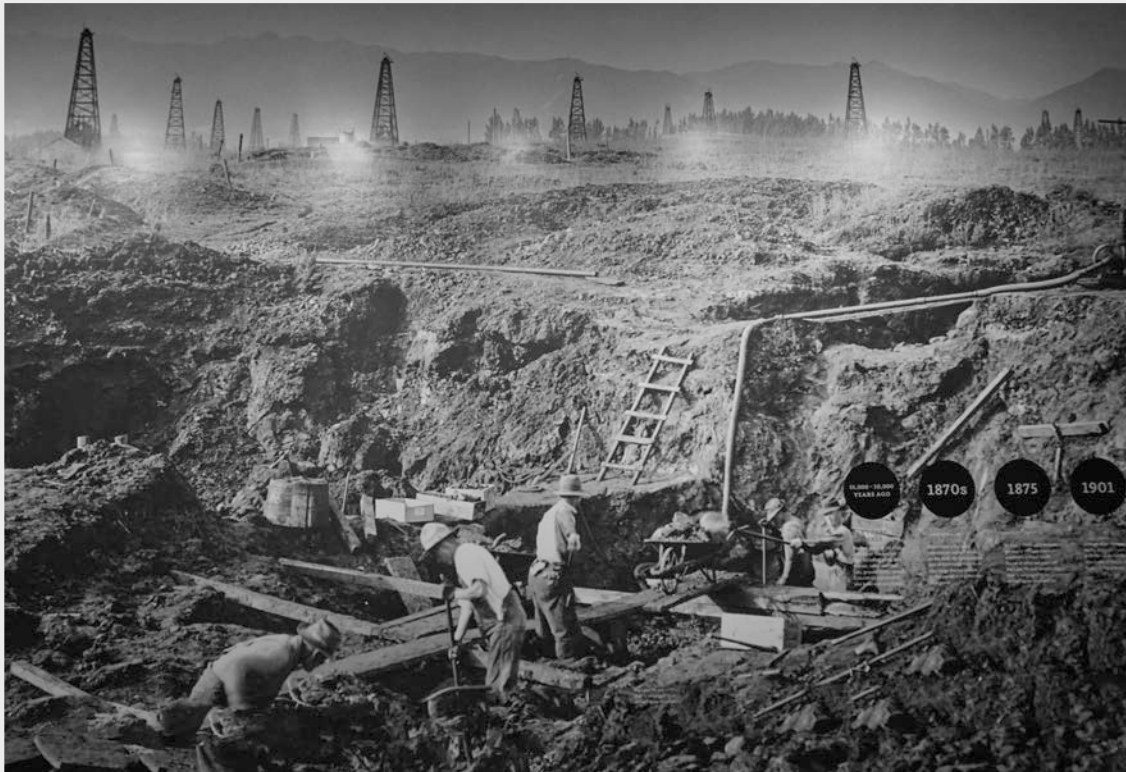
Early excavation for megafauna specimens at La Brea Tar Pits, around 1913 to 1915. Note the oil derricks of the Beverly Hills oil field in the background.