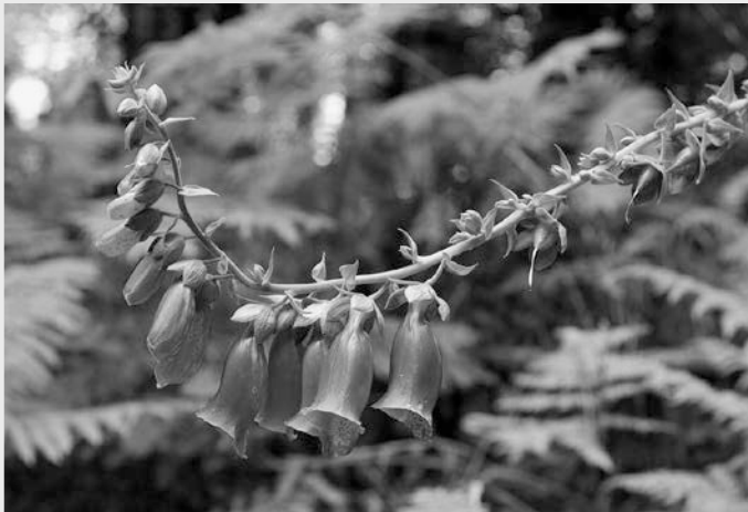
A curved stem of foxglove flowers grows toward the light.