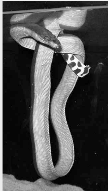
A yellow-bellied sea snake has to drink fresh water from the sea surface after it rains.