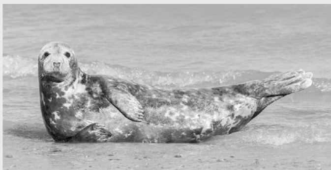
A seal acrobat on the beach.

So how do creatures that live in the sea get the water they need?