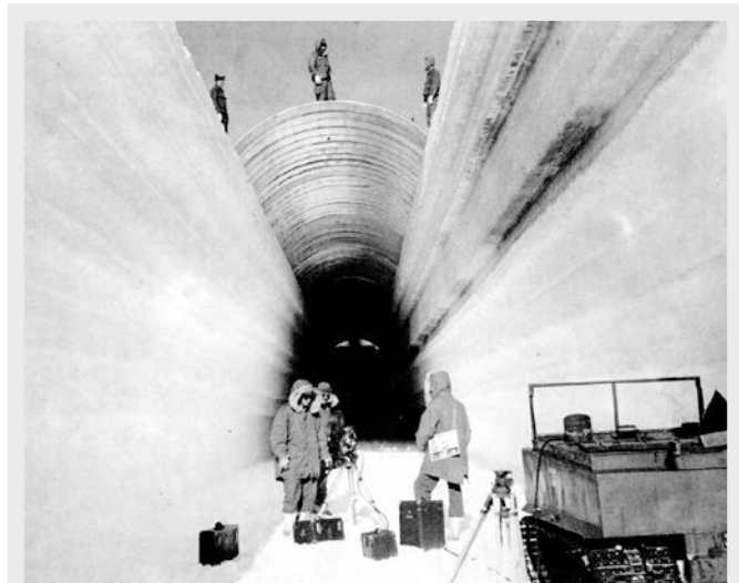
Camp Century trench construction in 1960.