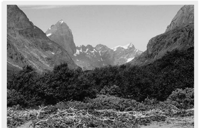
The Qinnngua Valley at the southernmost tip of Greenland has scrubby forests and tundra and may resemble the type of landscape indicated by the ancient soil found below Camp Century.