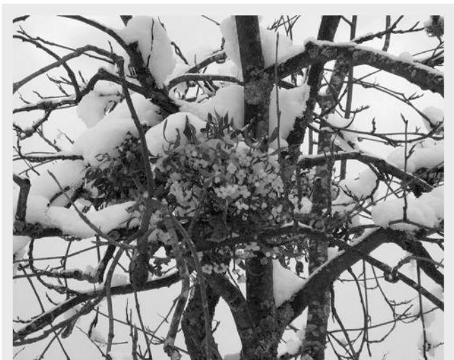
European mistletoe ( Viscum album ) in the snow in eastern France.