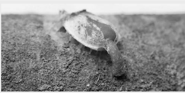
Mistletoe seed attaching itself to a branch via its haustorium.