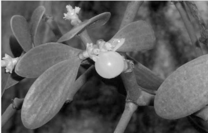
Leaves, flowers and berries of fir mistletoe ( Viscum album subsp. abietis ) in the Berlin Botanical Garden.