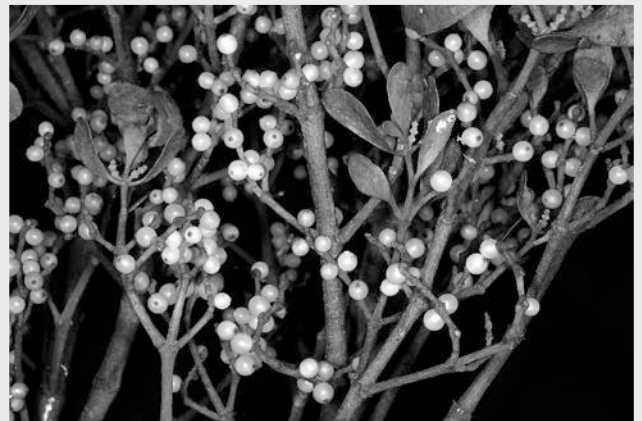
Phoradendron leucarpum is native to North America. It has broad oval leaves and clusters of ten or more berries.