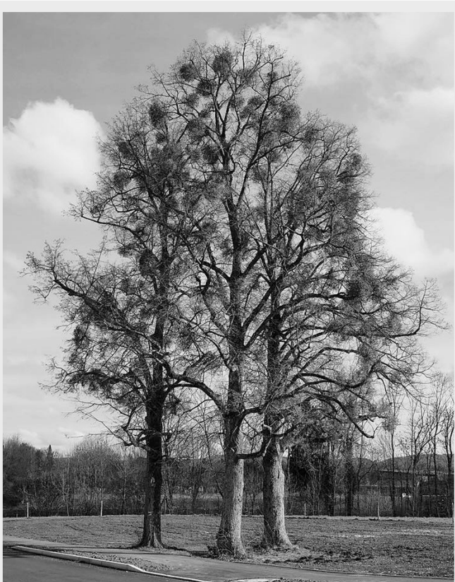
A group of trees heavily infested with mistletoe.