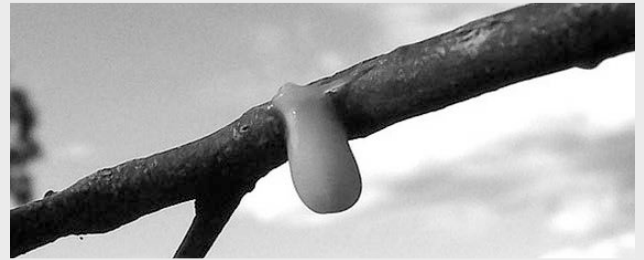
Mistletoe seed attached to a branch by viscum, transported in bird droppings. Mistletoe comes from the Anglo-Saxon miseltan , meaning “dung on a twig,” because they sprout where birds defecate.