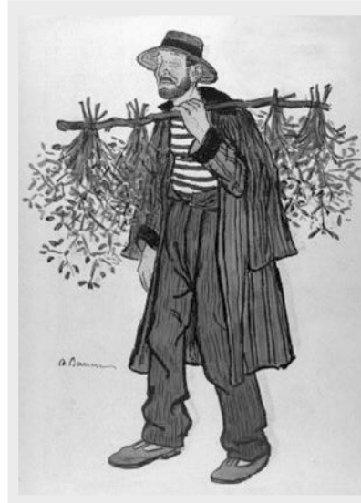
The Mistletoe Seller, a poster published around 1930 in France.