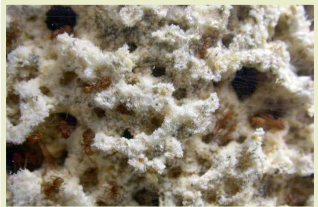
A colony of Atta laevigata leafcutter ants and their mutualistic fungus live in captivity at the Museum of Zoology of the University of São Paulo, Brazil.