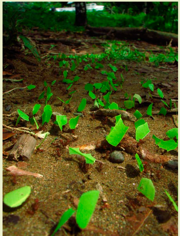
Leafcutter ants transporting leaves to their nest to feed their fungus farm.