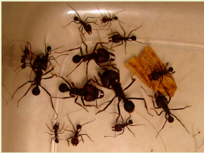
Different sizes of Atta insularis workers demonstrating the size variation of worker ants with different jobs in mature colonies.