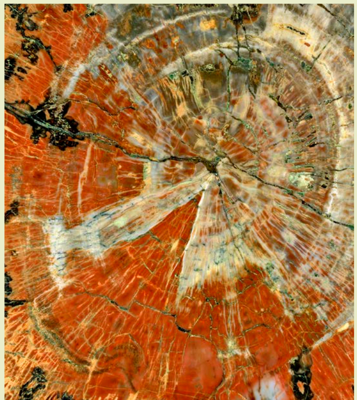
The colorful center of a polished slice of a petrified tree from Petrified Forest National Park, Arizona. If enlarged, it is possible to see insect borings in the wood that were made approximately 225 million years ago in the Late Triassic.