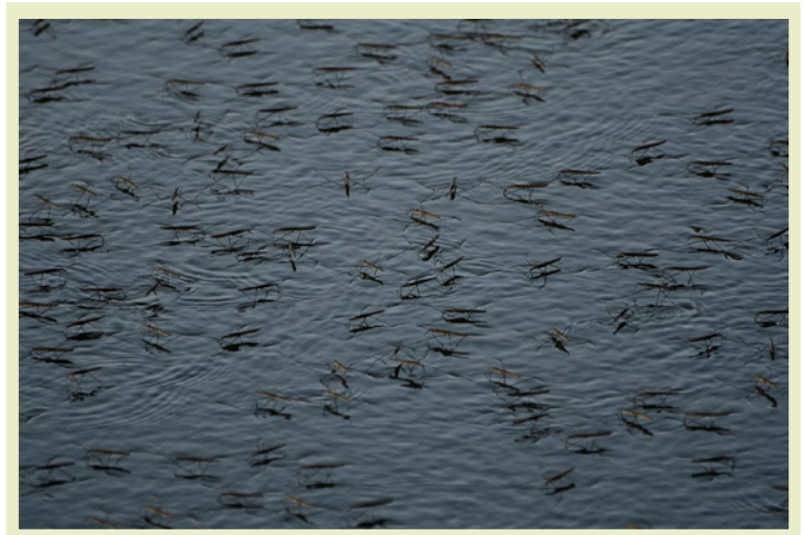
Gerrids gather on the surface of a pond in southern India.