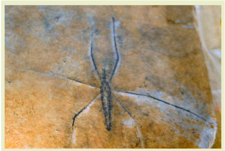
Fossil specimen of Chresmoda obscura from Jurassic rocks in Germany, on display at the Gallery of Paleontology and Comparative Anatomy in Paris.