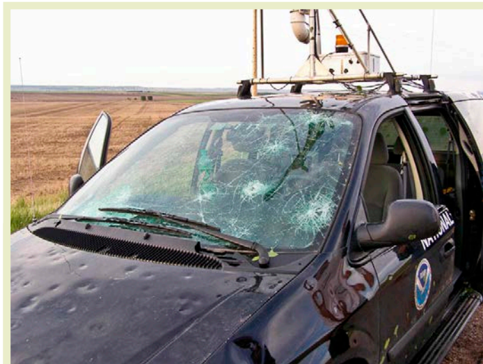
A NOAA vehicle shows damage from multiple large hailstone impacts.