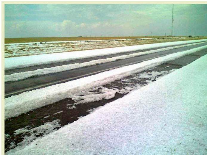
Hail may produce unexpected springtime icy driving conditions if it collects along a roadway.