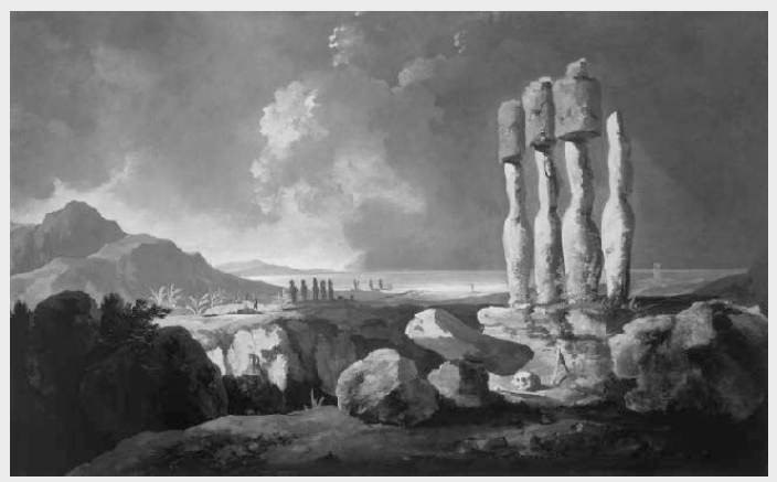
Moai on Easter Island, a painting by William Hodges, 1775–76.