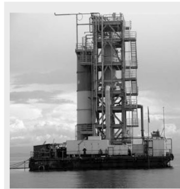
A methane extraction platform at Lake Kivu is helping to address Rwanda's power needs.