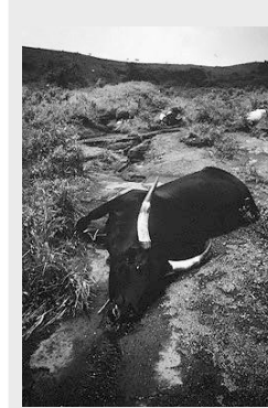
Livestock suffocated by a cloud of carbon dioxide in the 1986 Lake Nyos limnic explosion.