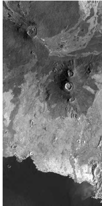
This 2002 image shows lava flows into Lake Kivu from two active Virunga Range volcanoes north of the population center of Goma/Gisenyi. Purple-highlighted flows are from Nyamuragira, while red-highlighted flows are from Nyiragongo. More recent flows from 2011 and 2021 are not shown.