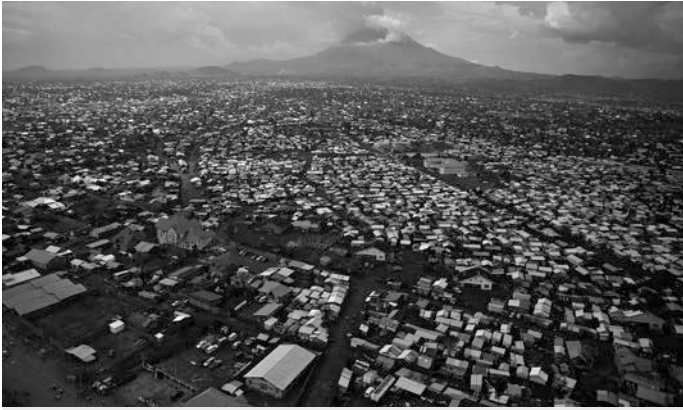
The sprawling city of Goma, with the Nyiragongo volcano in the background.