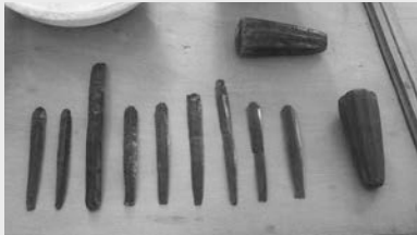
Obsidian blades knapped during the Bronze Age (3000–2300 BC) are displayed at the Archaeological Museum of

Naxos, a Greek island in the South Aegean.