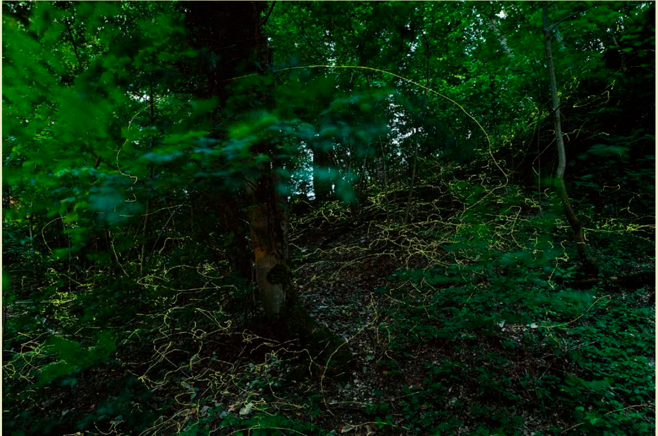
A 30-second exposure shows light trails of the European lesser glowworm ( Lamprohiza splendidula ) above the forest floor near Nuremburg, Germany.