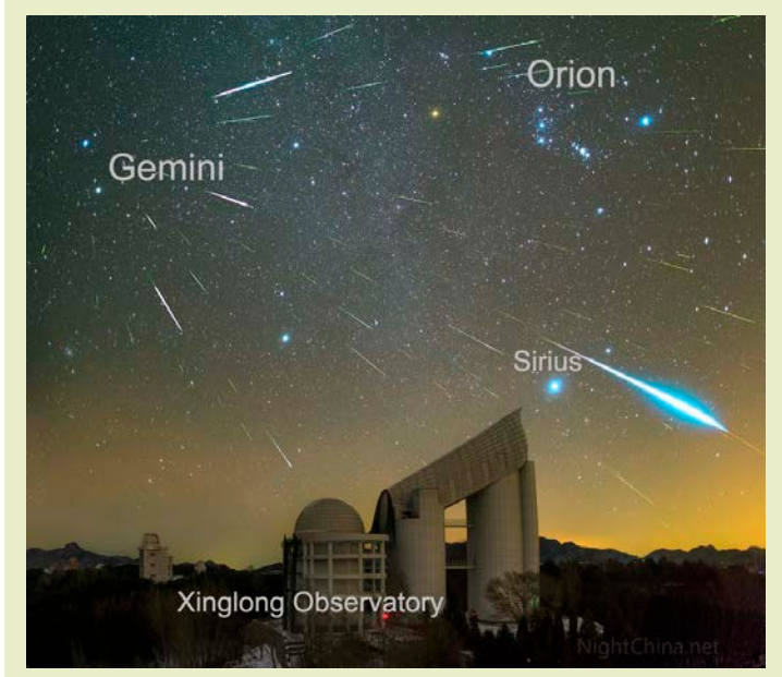
Geminids meteors shower the Xinglong Observatory in eastern China in December 2015.