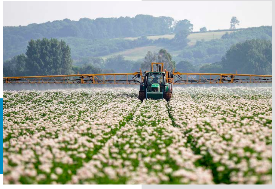
Spraying in a potato field for prevention of potato blight in Nottinghamshire, England.