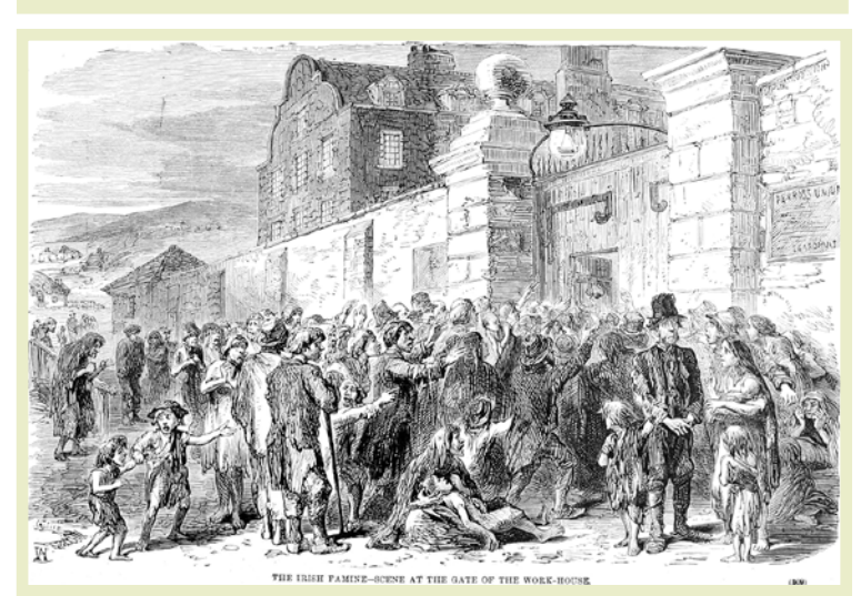
Irish peasants at the workhouse seeking work during the Great Famine of the 1840s.