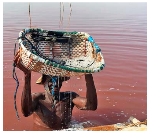
A worker harvests salt from Senegal's Lake Retba.