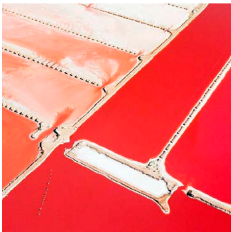
Evaporative ponds in Hutt Lagoon.