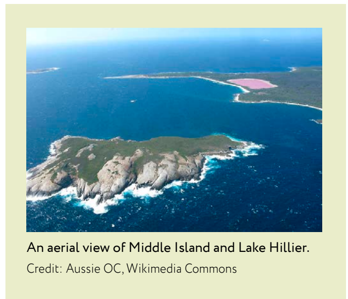
An aerial view of Middle Island and Lake Hillier.