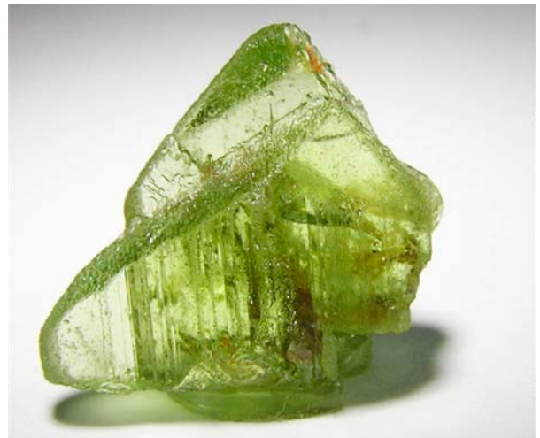
A historic specimen of peridot from Zabargad Island, Egypt.