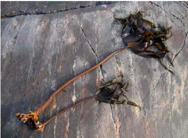
Two specimens of North Atlantic kelp, Laminaria hyperborea , show the anchoring holdfast at lower left, divided blades at upper right, and a stemlike stipe connecting the blade to the holdfast. In clear water, this species of macroalgae can grow to 100 ft (30 m).