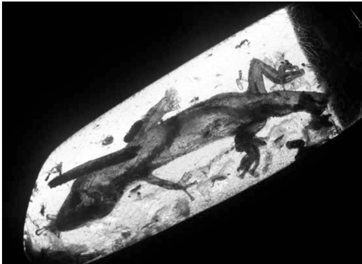
A gecko trapped in Oligocene-era amber from 22 to 33 million years ago at the Australian Fossil and Mineral Museum.