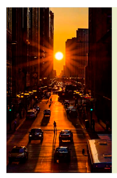
Cities constructed on grids with perfectly oriented eastwest streets, like Chicago, have spectacular equinox sunrises and sunsets that align along their avenues creating what some call "Chicagohenge."