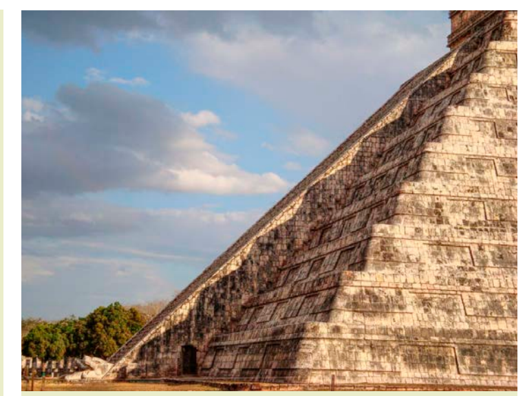
The Temple of Kukulkán at Chichén Itzá during the March equinox. The Mayan temple is famous for its design which makes the serpent god, Kukulkán, appear to slither down the side of the temple on the equinoxes.