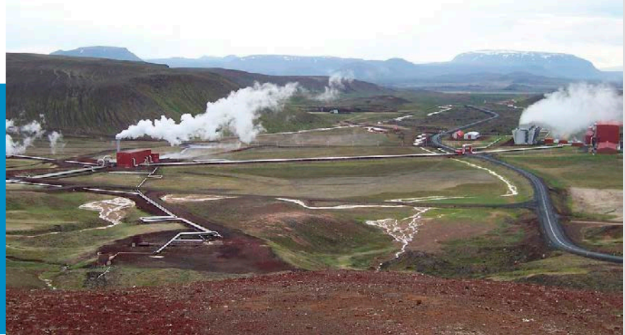
Krafla Geothermal Power Station in northeast Iceland.