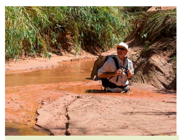
Quicksand in Courthouse Wash at Arches National Park in Utah.