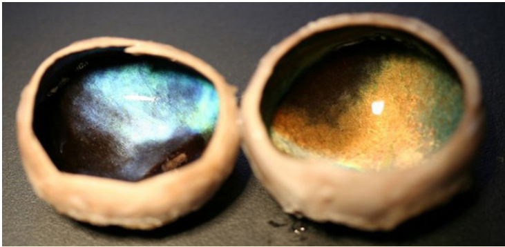
A blue eye from a reindeer that died in the winter (left), and a golden eye from one that died in summer.