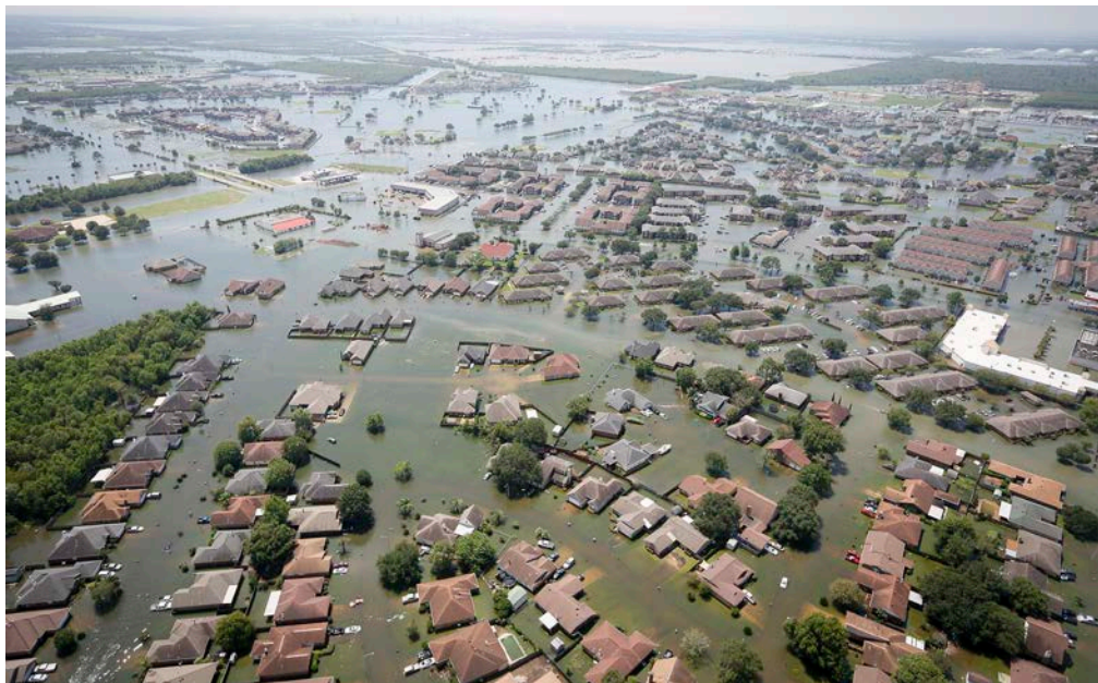
Flooding in Texas on August 31, 2017.